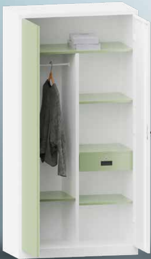
FHC FS HP3 ED HHR