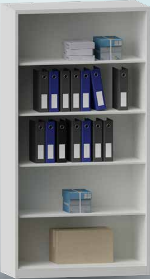
FHC 4 (WO/D)