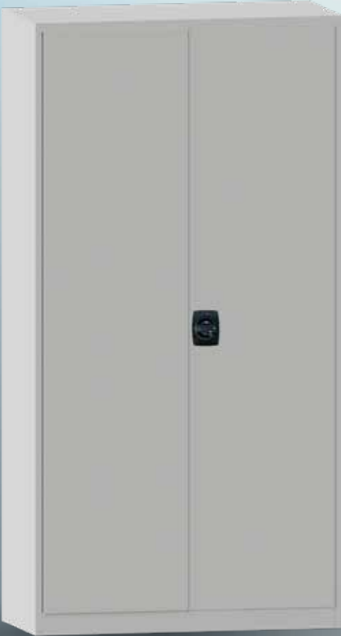
FHC 4 (WITH NUMERIC LOCK)