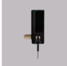
Recessed Handle cum Cam Lock (B)