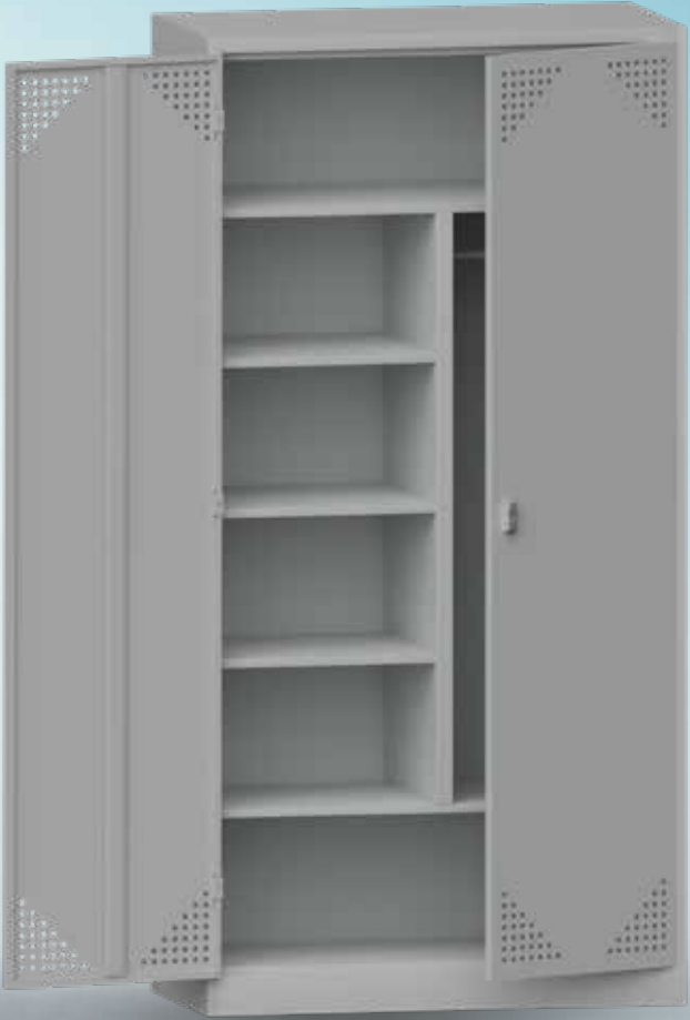
FHC FS2 HP3 HHR SPL