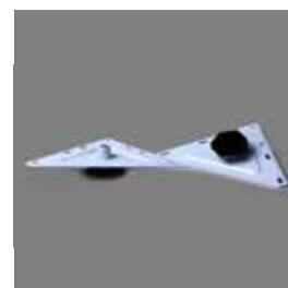
Leveler and gusset