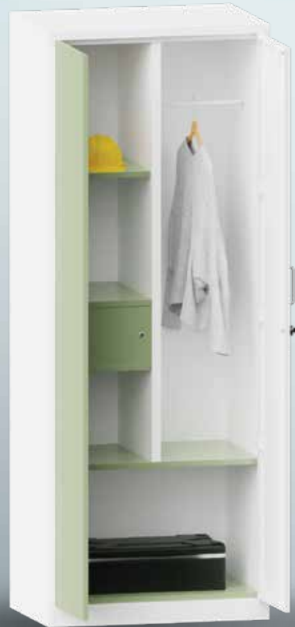
FHC FSB HP 1 HL HHR