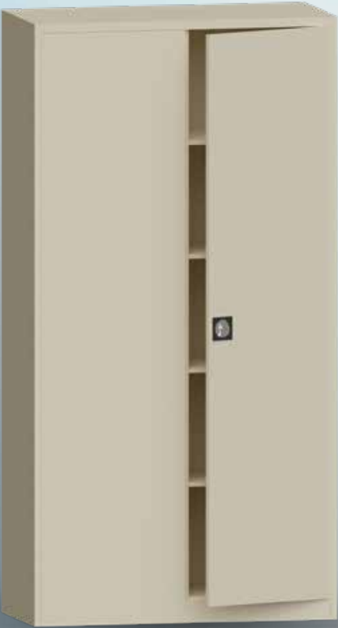
FHC 4 FOD