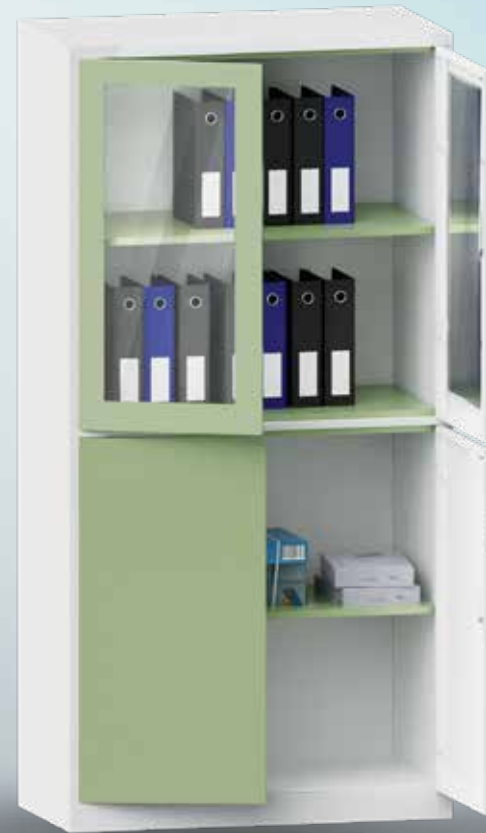
FHC 2 HG + HS SWD