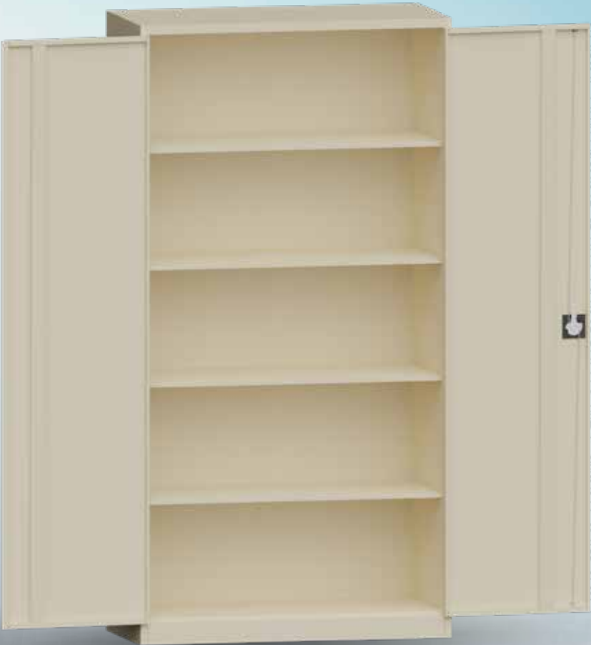
FHC 4 FOD