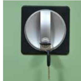
Recessed Handle cum Cam Square cut Lock (C)