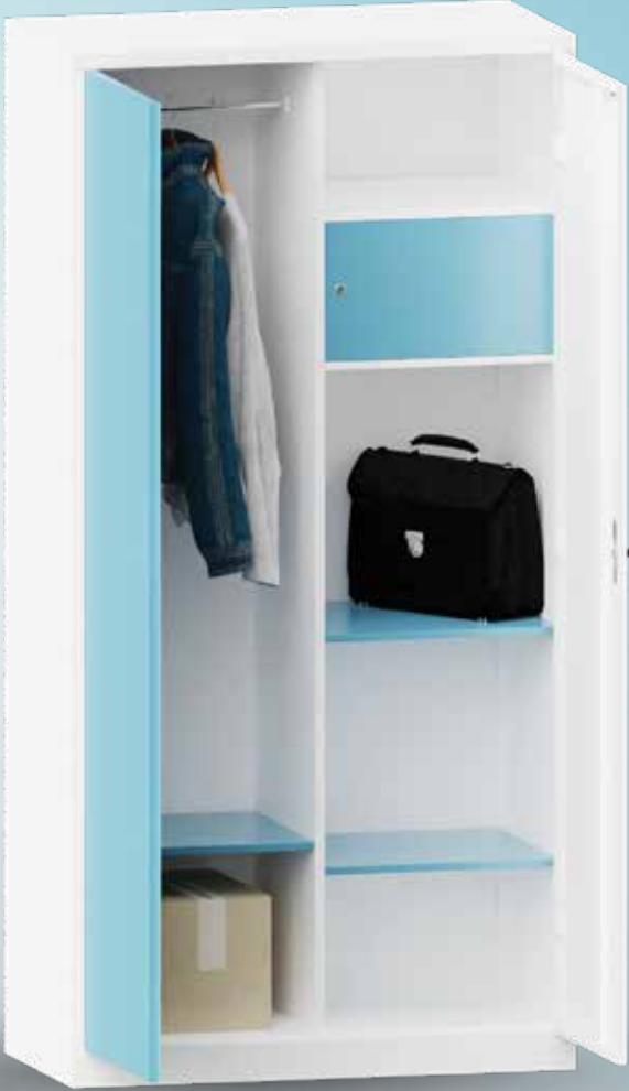
FHC FP 3/4 HL HHR