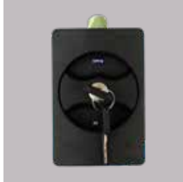
Recessed Handle cum Cam Lock (A)