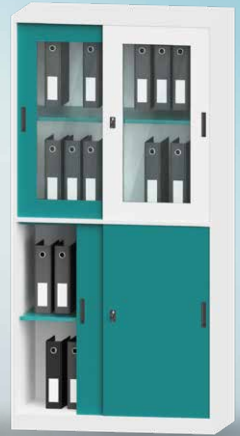
FGSSD 2 HG + HS