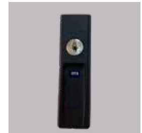
Hook Type Lock (B)