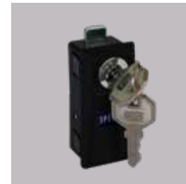
Hook Type Lock (A)