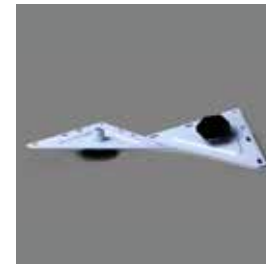
Leveler and Gusset