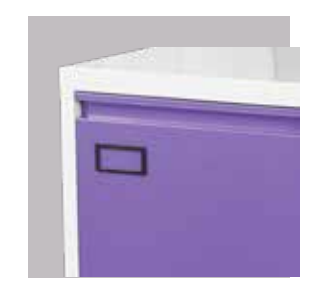
PVC Label Holder