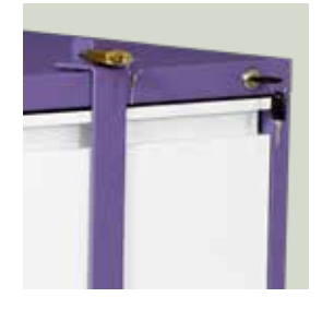
Security Bar with Padlock