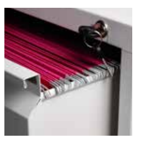
Swan neck Recessed handle SNH