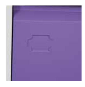
Formed Label Holder