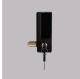
Recessed Handle with Cam Lock (B)