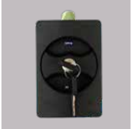
Recessed Handle with Cam Lock (A)