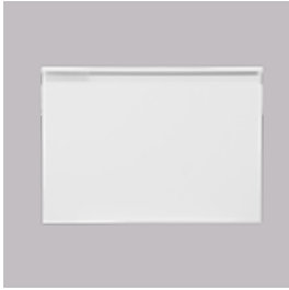
Rectangular Recessed handle RH