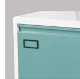
PVC Label Holder