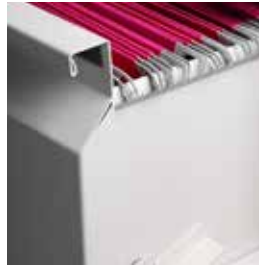
Swan neck Recessed handle SNH