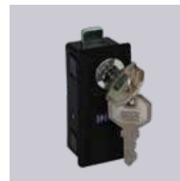
Hook Type Lock (A)