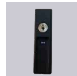
Hook Type Lock (B)